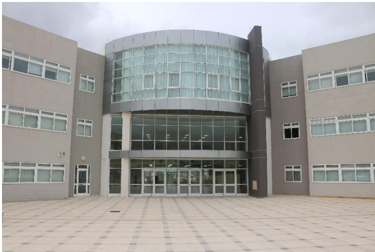
A governmental school in Malta

The education system in schools covers up topics a person needs to know in order to build a career or just simply be a knowledgeable human being. In fact, the survey I conducted has shown that 18 out of 20 students are fully or mostly satisfied with the topics taught to them. Many though also requested that a subject that teaches basic skills needs to exist since they will be pretty useful in every day life when students become adults.