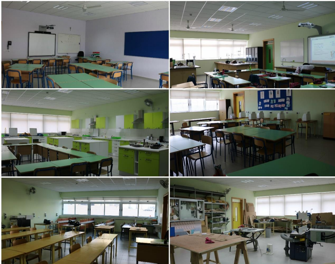
Classes, Labs and Workshops used for teaching (From Left to Right)

The variety of subjects in schools starts from mathematics and sciences up to arts and design & technology. Each subject is taught in appropriate classes and using multiple resources such as interactive whiteboards. 20 out of 20 students voted that most resources used for teaching are in fact very useful and make the learning and teaching process easier and more fun.