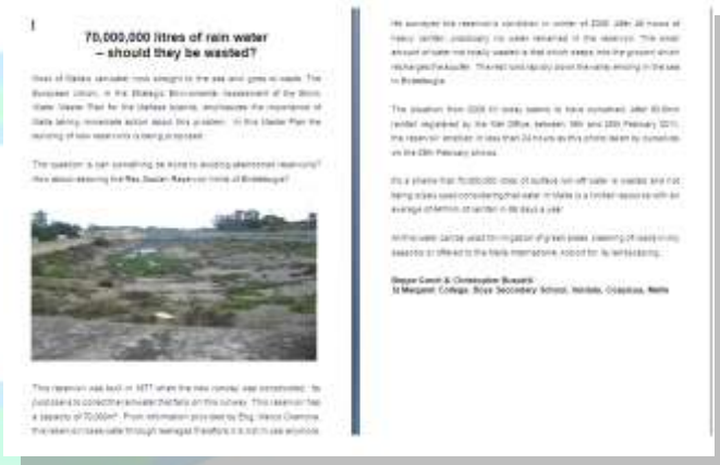
70,000,000 litres of rain water – should they be wasted? - (St Margaret College Boys' Secondary School, Verdala) Agriculture award

Another venture for this year is creating a “YRE group” on facebook and encourage YRE participating students to network through this medium. It will be a closed group, totally voluntary, and closely monitored. The international website will also feature an international facebook page – and the two will be interconnected, enabling networking and joint projects. More information will be given as soon as the pages are launched.