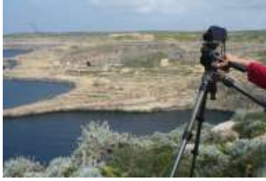
A school during a Mission