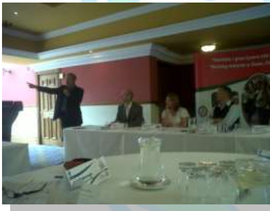
National operators' meeting April 2011

As already mentioned last year, the YRE international board has now changed and the new board – together with national operators have discussed ways and means in which the YRE programme can be more successful. Kindly note the following changes, as some are quite drastic and need to be given due attention from the beginning of the projects.