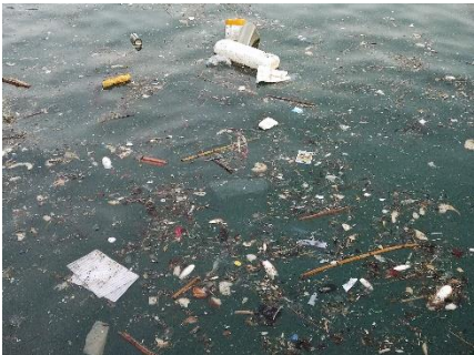
Contaminated sea water

Water pollution is one of the most common environmental problems. It is caused by oil spills or leaks, radioactive waste, global warming and many more environmentally threatening situations. This does not only pollute our seas and oceans, but also harms marine life.